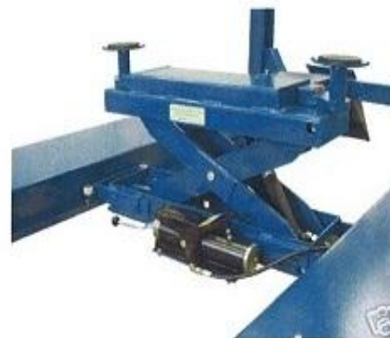
Rolling Jacks included